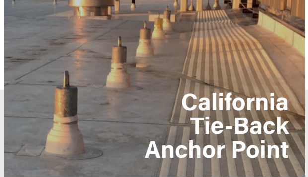
California Tie-Back Anchor Point

Cal-OSHA mandates special roof tie-backs are installed on every building 36 feet or more in height, and stipulates unique design, system layout, engineering and testing criteria. Guardian has designed custom anchors to meet these requirements. Get in touch for more detailed information.