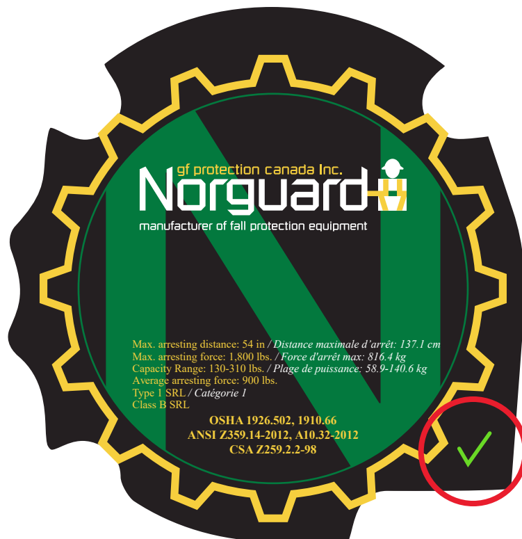
Fig. B - Example of Product Label After Inspection

Affected product will be relabeled and will be permanently marked with a green check mark as shown in Figure B to indicate that the product has been inspected.